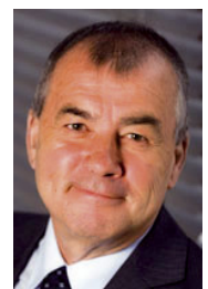
Acas Chairman Sir Brendan Barber

“The number of people who have decided to give early conciliation a go since its launch has been encouraging.”